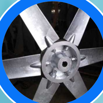
Impeller for F. D. Cooler