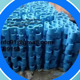
Inner Arm For ESP Rapping Systems