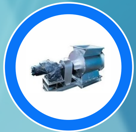
Rotary Airlock Valve