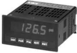
Digital Temperature Indicator Sensor