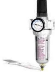
Air Pressure Regulator Gauge