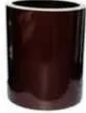
Conical Support Insulator