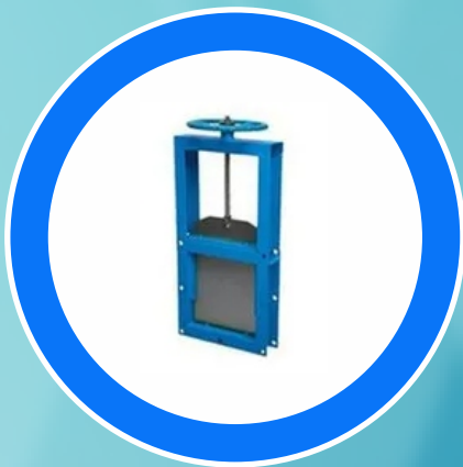
Slide Gate Valve