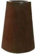
Cylinder Support Insulator