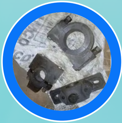
Plummer Block Bearing