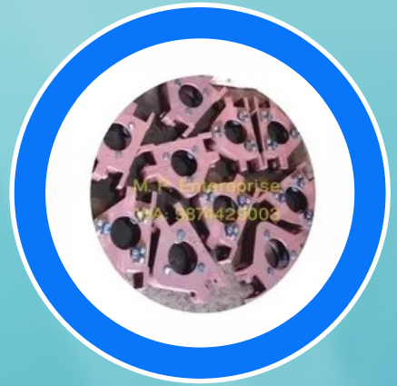
Bearing For ESP