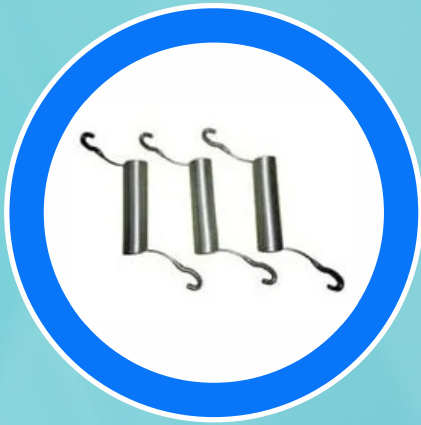
Emitting/ Discharge Electrode